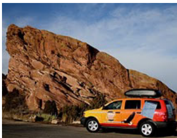
The census wagon dubbed "Warpaint" Susie and the census team are traveling in. They will travel 9,500 miles before they finish the 2010 Census Tribal Road Tour.

teams travels and Native people and tribes they are meeting along the way. She is also one of the drivers for "Warpaint," their decorated vehicle. They will be providing the 10 question census form that takes 10 minutes to fill out. This is part of a well-planned effort that will help get accurate information about the number and location of Native people. To protect information about individuals and families on the 2010 census, no information on the forms can be made public until 72 years after this census year.